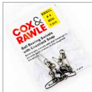
BALL BEARING SWIVELS WITH SNAP BRBBSCL

SIZES: 14 12 10 8 6 4 3 2 1 1/0 2/0 4/0 6/0 8/0 LBS: 30 45 65 80 100 180 220 310 410 510 660 730 1200 1540 QTY: 8 8 8 10 10 10 8 8 6 5 4 3 2 2