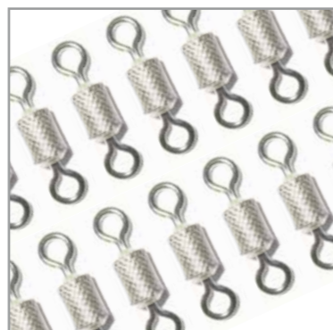
X-PATTERN BRASS ROLLING SWIVEL BRRSX

SIZES: 6 4 3 2 1 1/0 LBS: 55 80 100 120 165 210 QTY: 20 15 12 10 10 8