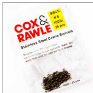
STAINLESS STEEL CRANE SWIVELS CS

SIZES: 000 0 1 3 4 5 6 7 LBS: 46 65 110 200 280 335 445 555 QTY: 4 4 4 4 4 3 2 2