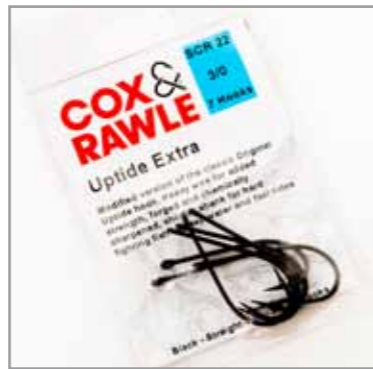
UPTIDE EXTRA SCR22

SIZES: 1 2 4 6 1/0 2/0 3/0 4/0 5/0 6/0 7/0 QTY: 10 10 10 10 7 7 6 5 5 4 BLACK NICKEL FINISH, STRAIGHT EYE