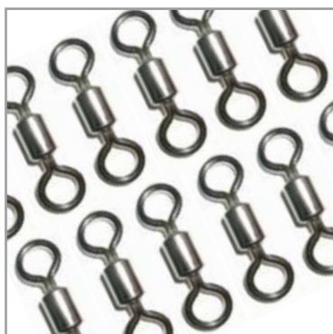
BRASS ROLLING SWIVEL BRRS

SIZES: 6 5 4 2 1 2/0 LBS: 70 120 170 245 320 450 QTY: 10 9 7 6 4 3