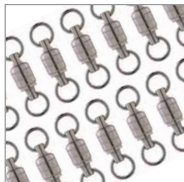
STAINLESS BALL BEARING SWIVEL BBS

SIZES: 00 2 3 4 7 9 LBS: 33 65 130 200 320 530 QTY: 5 5 5 5 3 2