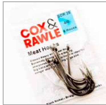
MEAT HOOK SCR25

SIZES: 1 2 4 6 1/0 2/0 3/0 4/0 6/0 QTY: 10 10 10 10 7 7 7 6 5 BLACK FINISH, STRAIGHT EYE