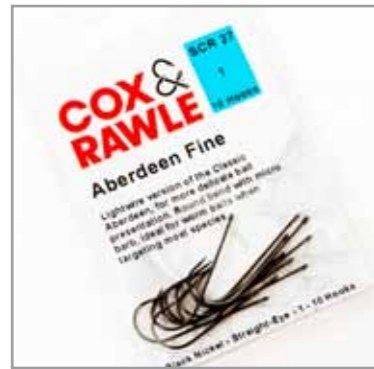
ABERDEEN MATCH SCR27

SIZES: 8 6 4 1 1/0 2/0 3/0 4/0 5/0 6/0 QTY: 10 10 10 10 7 7 6 5 5 4 BLACK NICKEL FINISH, STRAIGHT EYE