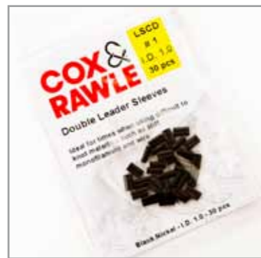
DOUBLE LEADER SLEEVES LSD

SIZE mm: .84 1.19 1.40 1.80 2.16 2.44 2.69 2.94 3.34 QTY: 30 30 30 25 25 20 15 15 10