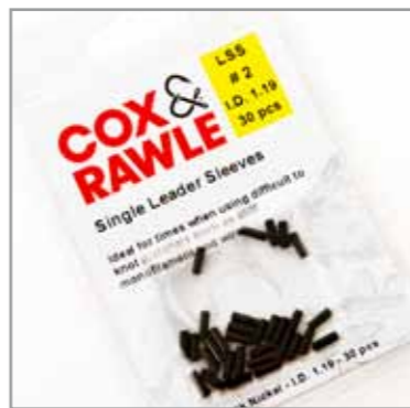
SINGLE LEADER SLEEVES LLS

SIZES: 00 0 1 2 4 6 7 8 10 LBS: 22 30 44 60 110 180 250 350 450 QTY: 10 10 10 10 9 5 4 3 3