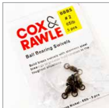
BRASS BALL BEARING SWIVEL BRBBS

SIZES: 14 12 10 8 6 4 2 1 1/0 2/0 3/0 4/0 5/0 6/0 QTY: 20 20 20 15 15 15 7 7 6 5 5 4 BLACK NICKEL FINISH, UP EYE