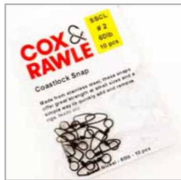
COASTLOCK SNAP CLS

SIZES: 0 1 2 3 4 5 6 7 LBS: 25 40 50 75 100 127 202 250 QTY: 25 25 20 15 10 10 9 7