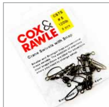
CRANE SWIVELS WITH SNAP CSTS

SIZES: 00 1 2 3 4 5 6 7 LBS: 22 30 44 60 90 120 180 250 QTY: 5 6 6 6 5 4 3 2