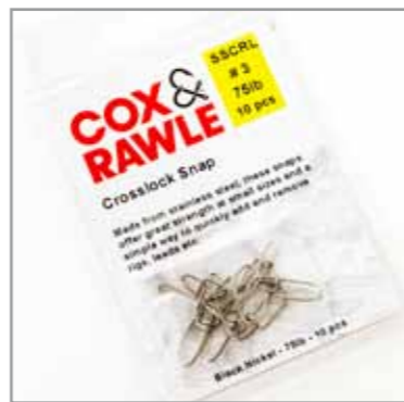
CROSSLock SNAP CRLS

SIZES: 5 3 1 LBS: 60 100 180 QTY: 10 10 10